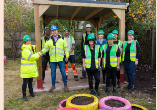
Grahams at St Matthias School